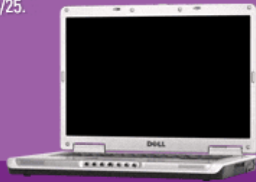
Inspiron™ 6000 with 15.4" display