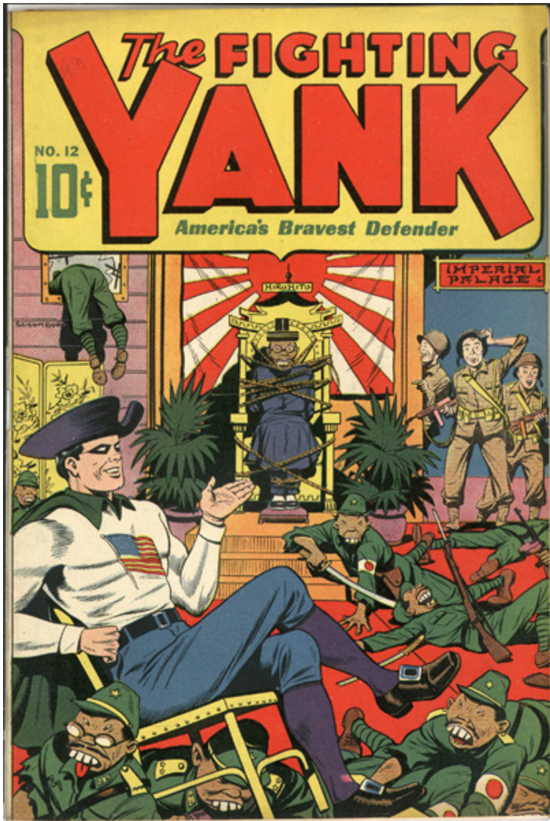
The Japs, circa 1943