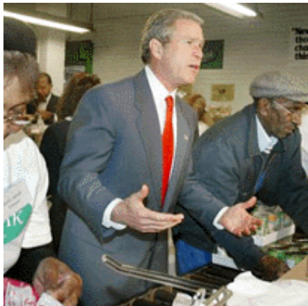
Bush talks about the importance of funding foodbanks at a DC Food Bank [12/19/02]

“I hope people around this country realize that agencies such as this food bank need money. They need our contributions. Contributions are down. They shouldn't be down in a time of need. We shouldn't let the enemy affect us to the point where we become less generous. Our spirit should never be diminished by what happened on September the 11th, 2001. Quite the contrary. We must stand squarely in the face of evil by doing some good.”