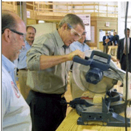
President George W. Bush takes a turn at a table saw before "thanking American Workers" on Labor Day [9/2/02]

"Our workers are the most productive, the hardest working, the best craftsmen in the world. And I'm here to thank all those who work hard to make a living here in America." – Bush, 9/2/02