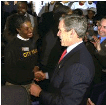
Bush about the importance of the Boys and Girls Club of America [1/30/03]

“I want to thank the Boys & Girls Clubs across the country...The Boys & Girls Club have got a grand history of helping children understand the future is bright for them, as well as any other child in America. Boys & Girls Clubs have been safe havens. They're little beacons of light for children who might not see light. And I want to thank them for their service to the country. Part of the vision for America is that we have a mosaic of all kinds of people providing love and comfort for people who need help.” – Bush, 1/30/03