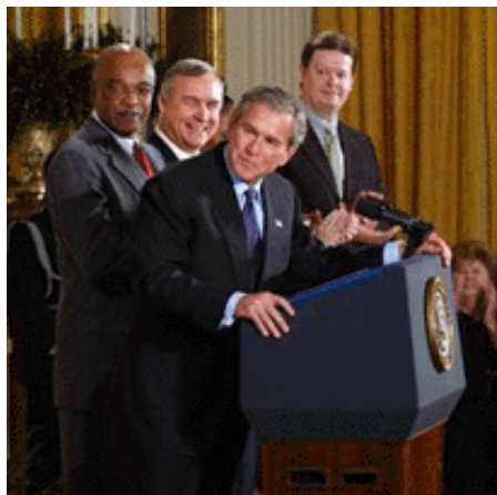
Bush talks up the need for education funding at the one-year anniversary of the No Child Left Behind Act [1/8/03]

“This administration is committed to your effort. And with the support of Congress, we will continue to work to provide the resources school need to fund the era of reform.” – Bush, 1/8/03