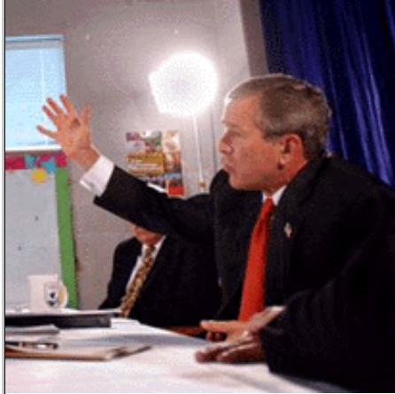
Bush in Madison "calls for worker pension protection [8/7/02]

"We've got to do more to protect worker pensions." – Bush, 8/7/02