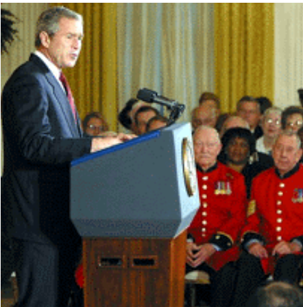
Bush honors American and British veterans at a White House ceremony [11/11/02]

“These men and women are still the best of America. They are prepared for every mission we give them, and they are worthy of the standards set for them by America’s veterans. Our veterans from every era are the finest of citizens. We owe them the life we know today. They command the respect of the American people, and they have our everlasting gratitude.” – Bush, 11/11/02