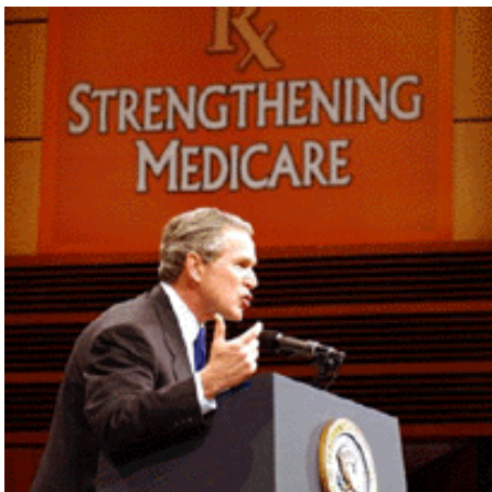
Bush touts the need to adequately fund Medicare in Michigan [1/29/03]

Under Bush’s proposal, there should be a roughly $40 billion increase in Medicare each year for a decade. However, Bush’s 2004 budget proposes just $6 billion – 85% less than what would be needed to meet his goal . Additionally, his budget would leave 67% of the total $400 billion pledge to be spent after 2008. [Bush Budget, pg. 318]