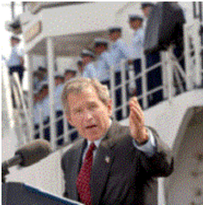
Bush talks of the need to fund port security at Port Elizabeth, NJ [6/24/02]

"We're working hard to make sure your job is easier, that the port is safer. The Customs Service is working with overseas ports and shippers to improve its knowledge of container shipments, assessing risk so that we have a better feel of who we ought to look at, what we ought to worry about." – Bush, 6/24/02]