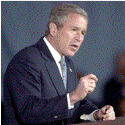
Bush promotes ethanol at Ethanol Plant in Wentworth, South Dakota [4/24/02]

“I said when I was running for President, I supported ethanol, and I meant it. (Applause.) I support it now, because not only do I know it's important for the ag sector of our economy, it's an important part of making sure we become less reliant on foreign sources of energy.” – Bush at South Dakota Ethanol Plant 4/24/02