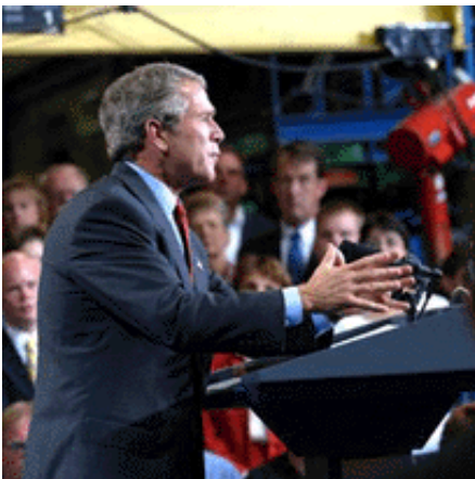
Bush “Stresses Budget Discipline and Fiscal Restraint” in Iowa [9/16/02]

“One of the ways we've got to make sure that we keep our economy strong is to be wise about how we spend our money. If you overspend, it creates a fundamental weakness in the foundation of economic growth. And so I'm working with Congress to make sure they hear the message -- the message of fiscal responsibility.” Bush, 9/16/02