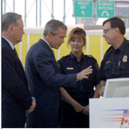
Bush touts border security with Canadian Prime Minister Chretien in Detroit [9/9/02]

“A secure and efficient border is key to our economic security.” – Bush, 9/9/02