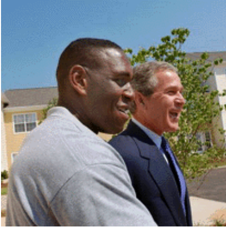
Bush touts housing funds at the Carver Homes in Atlanta, which is supported by a HUD Hope VI grant [6/17/02]

"Part of being a secure America is to encourage homeownership." He also went on to talk about his experience meeting the residents saying, "You know, today I went to the -- to some of the home -- met some of the homeowners in this newly built homes and all you've got to do is shake their hand and listen to their stories and watch the pride that they exhibit when they show you the kitchen and the stairs...They showed me their home. They didn't show me somebody else's home, they showed me their home. And they are so proud to own their home and I want to thank them for their hospitality, because it helps the American people really understand what it means."