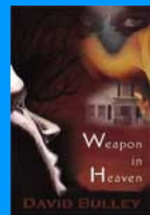
Weapon In Heaven