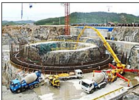
One of two reactors currently under construction in North Korea.

Donald Rumsfeld, the US secretary of defense, was on the board of technology giant ABB when it won a deal to supply North Korea with two nuclear power plants.