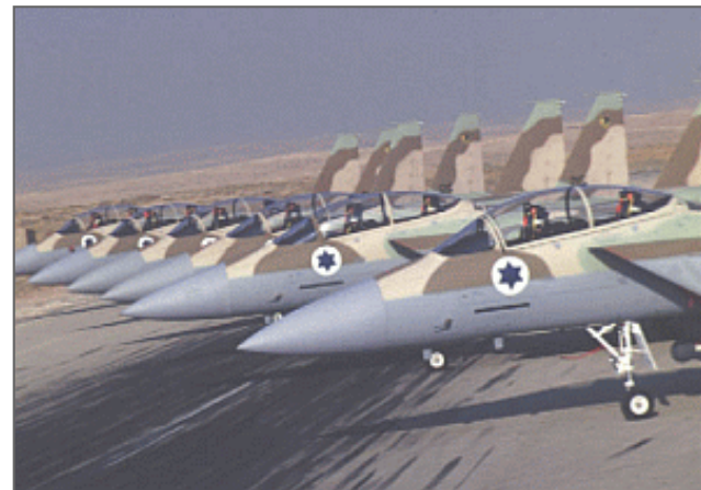
IAF F-15i squadron

Raz believes an aerial assault on Iran's nuclear facilities is possible. There are many things that the IAF has done over the past few years that the public is not aware of,