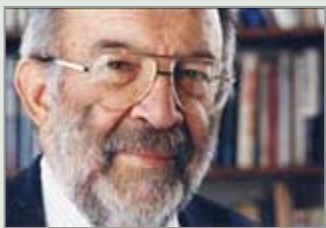
Sheinbaum: Carter's 'Apartheid' Mistake