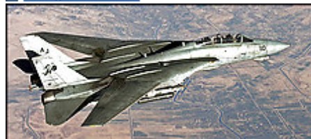
A top priority for Iran are parts for the F-14 fighter jet, which the United States allowed Tehran to buy in the 1970s.