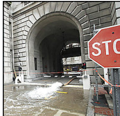
Flood waters are pumped onto 12th Street from the basement of the main IRS building, which

suffered extensive damage and may be closed for six months.