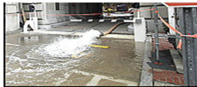
Flood waters are pumped onto 12th Street from the basement of the main IRS building, which suffered extensive damage and may be closed for six months.