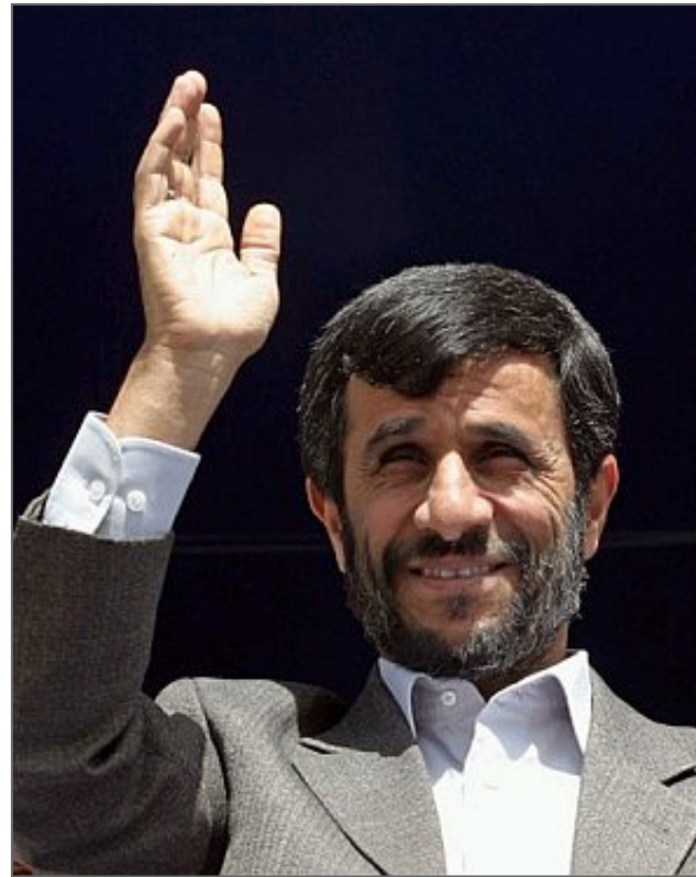
Iranian President Mahmoud Ahmadinejad, waves to people during his trip to Arak, a town in central Iran.