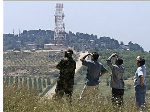
A Hizbullah operative, left, and Lebanese citizens watch IAF jets from the Lebanese-Israeli border at the Abbad Tomb, facing the northern Kibbutz Manara, background, near the village of Houla, southern Lebanon.

WAR IN THE NORTH: JPOST.COM SPECIAL COVERAGE