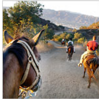
36 Hours in Hollywood