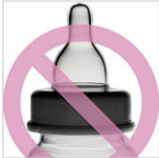
Warner: Mothers Who Bottle-feed