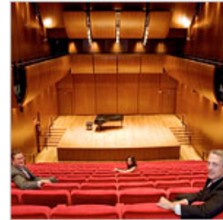
New Concert Space at the Morgan Library

A new interview series with prominent personalities. This week: Larry Kramer and Ruth Reichl.