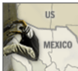
The U.S.-Mexico border is at the forefront of a growing debate over U.S. immigration and border security reform.