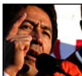
The Washington Post's coverage of the immigration issue, from the politics of revising the nation's immigration laws to the impact of illegal immigration on the U.S.-Mexico border and the Washington region.