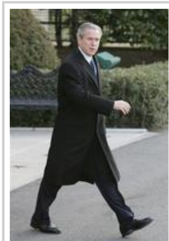
President Bush walks from the residence, Friday, March 18, 2005, as he departs the White House for...

In Orlando, mother and son also stopped at the Life Project Senior Development Center where seniors, seated at round tables, had just finished lunch. Fully aware of her role as Social Security