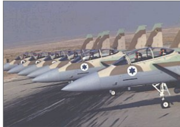
IAF F-15I's stand ready.

The discussions, which were describes as intelligence-oriented and not policy-oriented, examined the likelihood of an Israeli pre-emptive attack against Iran and the method in which such an attack could be carried out. One of the main questions presented in these discussions was whether Israel would inform the US in advance in case such an attack is to take place and when would such an advance notice be given.