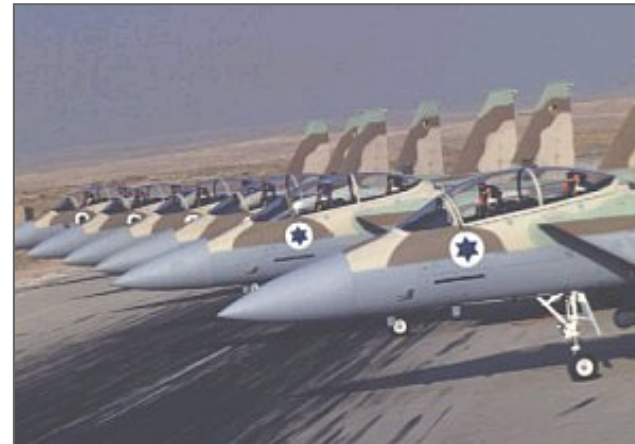
IAF F-15I's stand ready.