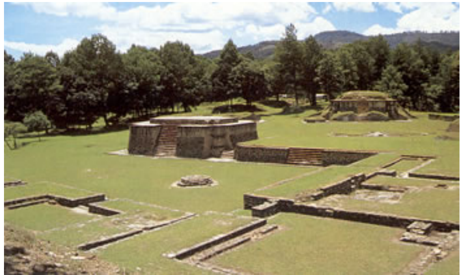
PRIESTS TO PURIFY SACRED MAYAN ARCHAEOLOGICAL SITE TO ELIMINATE BUSH'S "BAD SPIRITS"