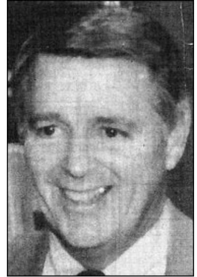
The Salt Lake Tribune, 1991