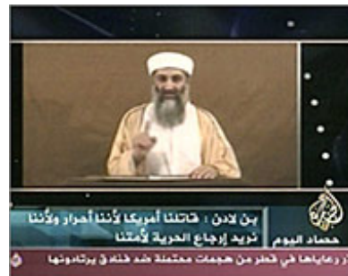
Bin Ladin directed his message at the American people

But I am amazed at you. Even though we are in the fourth year after