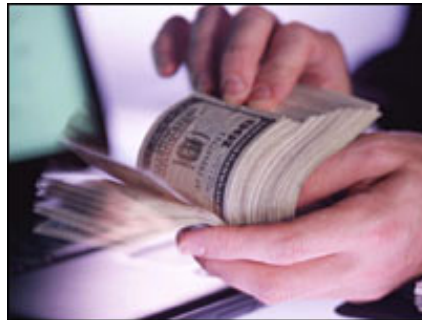
A higher tax take is boosting the government's coffers

Bumper tax income has helped the US government cut its 2006 federal budget deficit to a four-year low of $247.7bn (£133bn), the US Treasury has said.