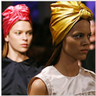
Fashion Diary: In Milan, Nonstop Laughs