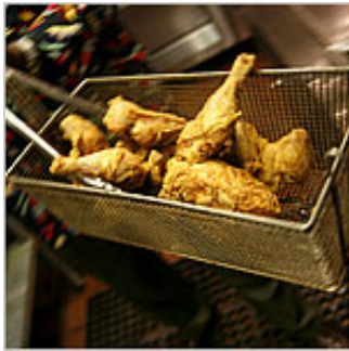
Big Brother in New York Kitchens?