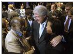
Clinton raises $7.3 bln to help tackle world woes