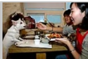
Slideshow: Cooking class for dog food in Seoul